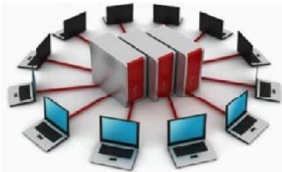
Samba As Primary Domain Controller